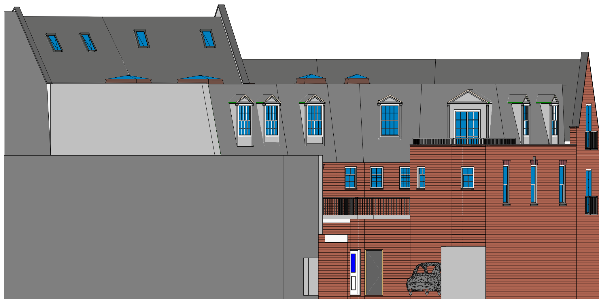
5 Rear Elevation B 1 : 100