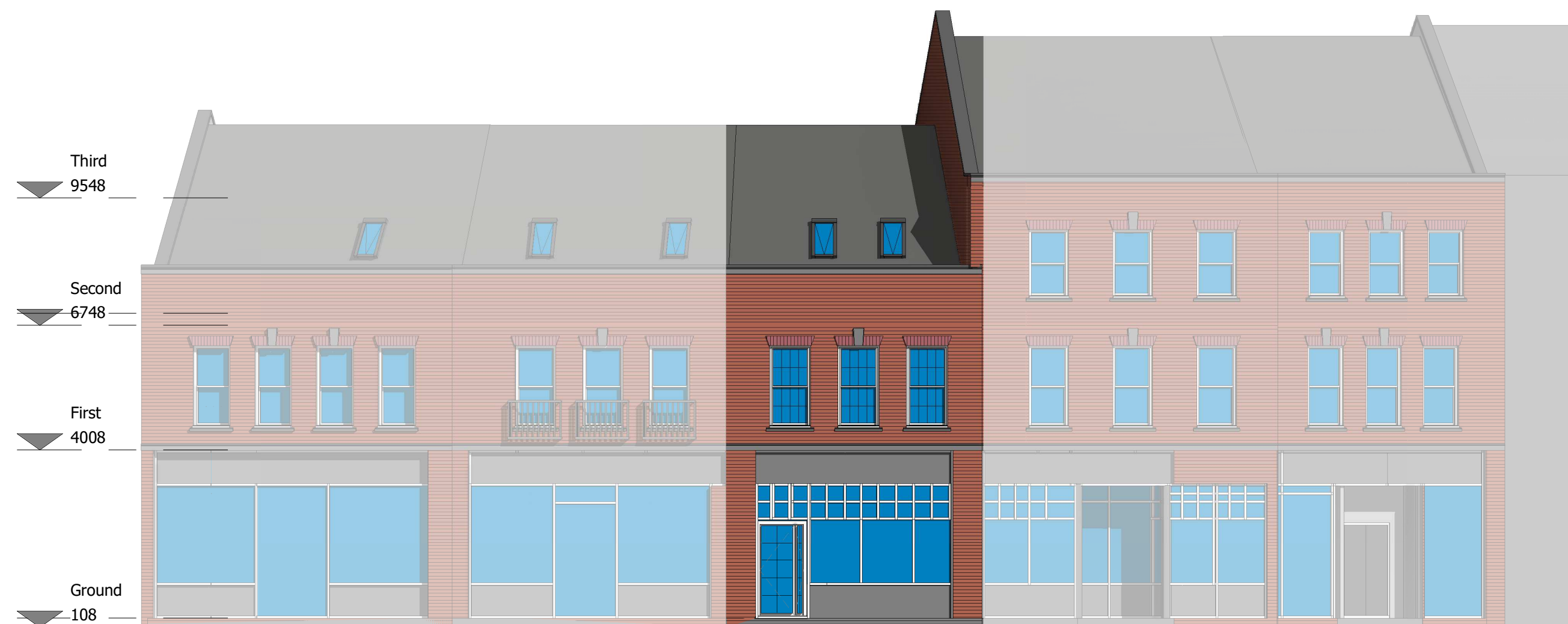
4 Front Elevation A 1 : 100

New Entrance from Market Place to residential apartments above