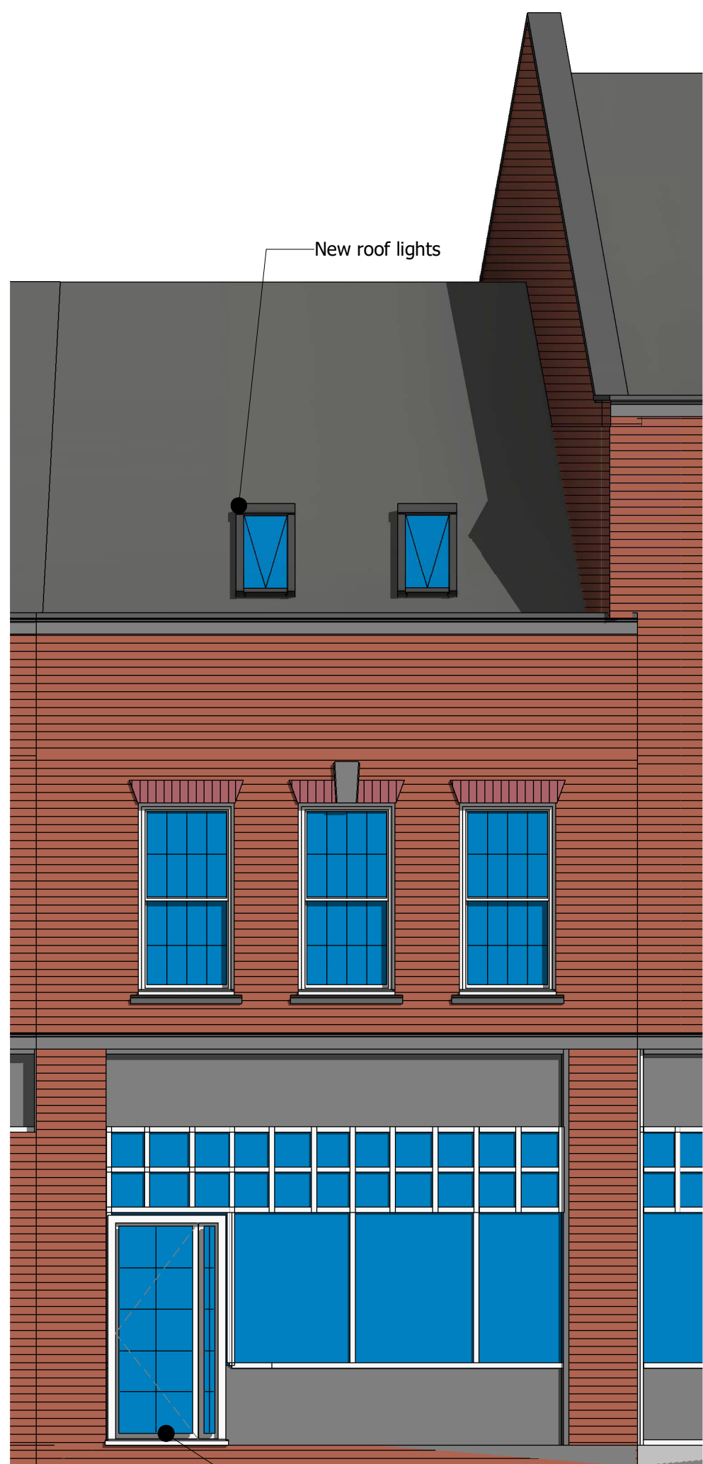
2 Detail A 1 : 50

New entrance door to residential apartments, ground ramped locally to provide level access