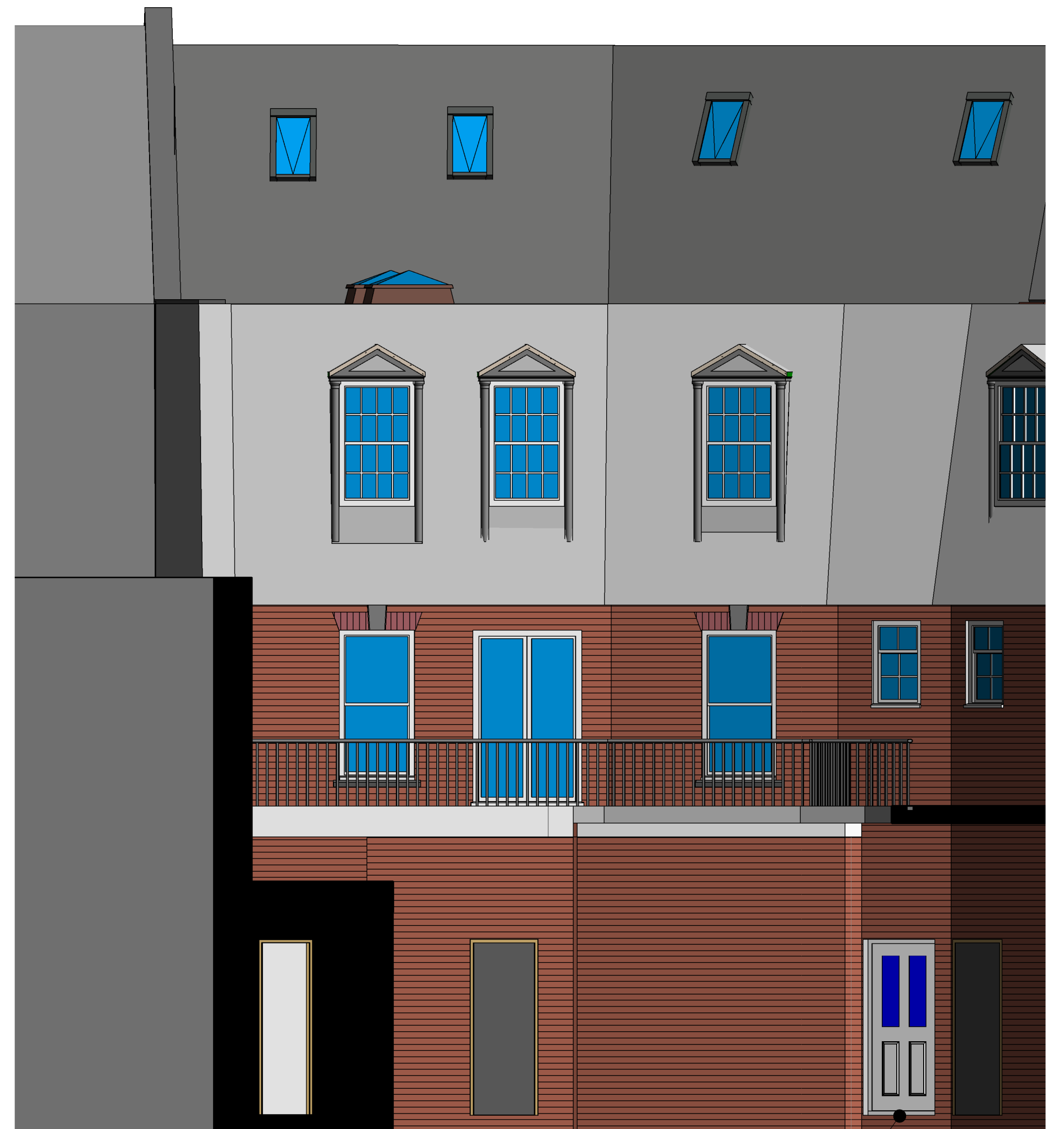
7 Rear Elevation D 1 : 50

New entrance door to residential apartments, ground ramped locally to provide level access